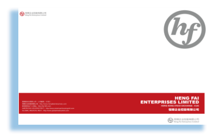
Hong Kong Stock Exchange Listed Restructured from the verge of Bankruptcy

Currently Known as ZH International Limited